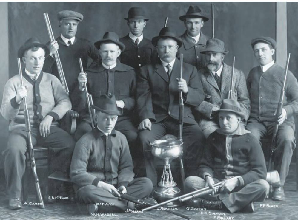
Greater Edmonton Gun Club - 1913