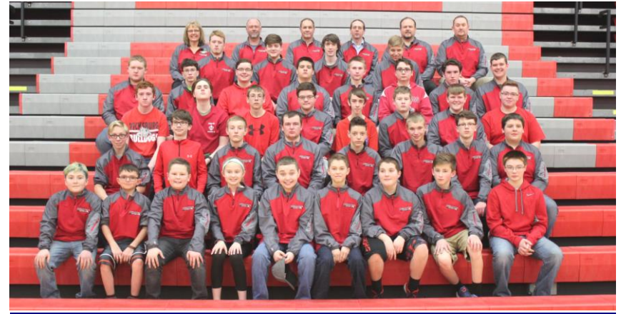
2017 Vicksburg High School Team, Michigan State Clay Target Trap League

St. Joseph County Conservation & Sportsman Club, Inc. is promoting the shotgun shooting sports through several active youth programs. The mixed club team is the St. Joe County SCTP Straight Shooters and has 5 certified shotgun coaches. The youth served range in age from 9 years old (4H) to 23 years old (AIM), depending on the specific program. We believe the future of our sport will continue if we help our youth become responsible, active participants. The teams have received NRA Foundation and MidwayUSA Foundation Grants to help support youth participation in these beneficial programs. Call 269-483-6803 for more details on any of these four shotgun programs.