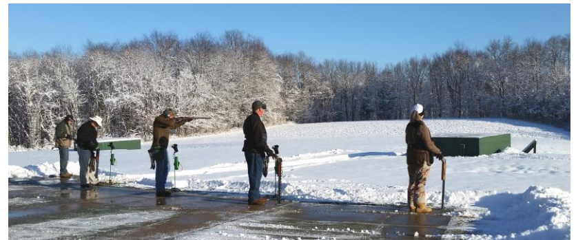
Such a pretty season for shooting when the sun’s out!

St Joseph County Conservation & Sportsman Club runs both Fall and Winter Trap “Money Leagues”. Fall runs Oct – Nov; Winter runs Jan – March. Call 269-483-6803 for details & dates