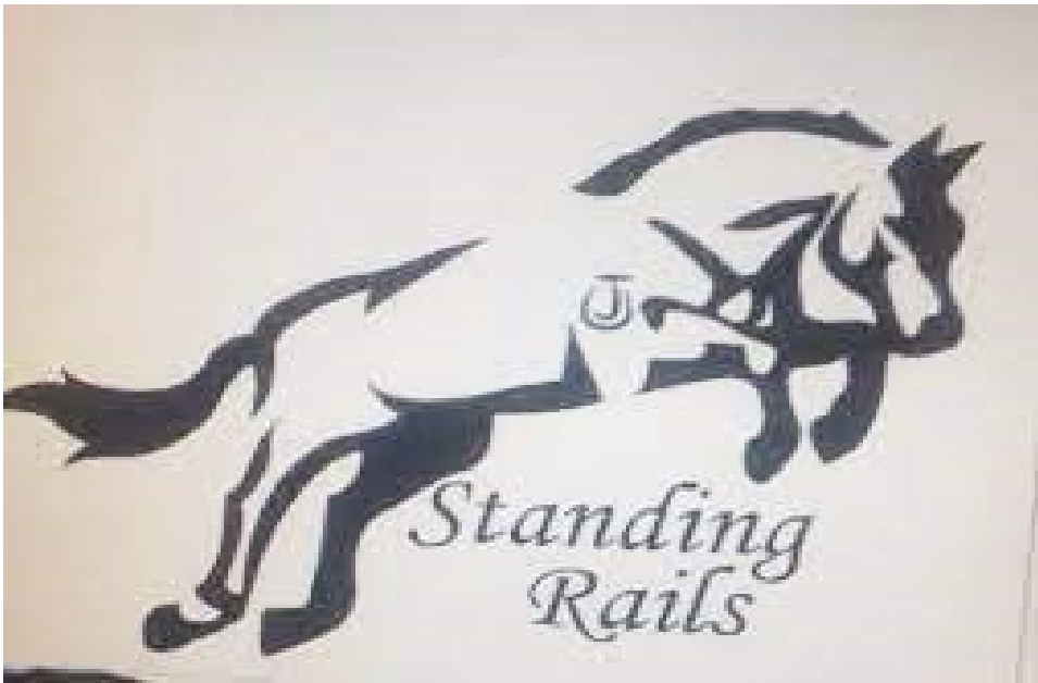
Standin Rails Stables